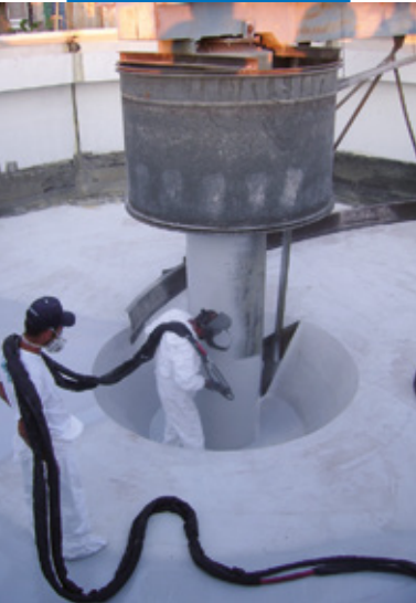
Close-up of a Purtop 1000 waterproof coating applied on various substrates (cementitious and metallic)