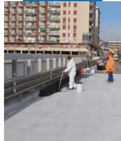
Application of Purtop Primer Black

Although the technical details and recommendations contained in this product data sheet correspond to the best of our knowledge and experience, all the above information must, in every case, be taken as merely indicative and subject to confirmation after long-term practical application; for this reason, anyone who intends to use the product must ensure