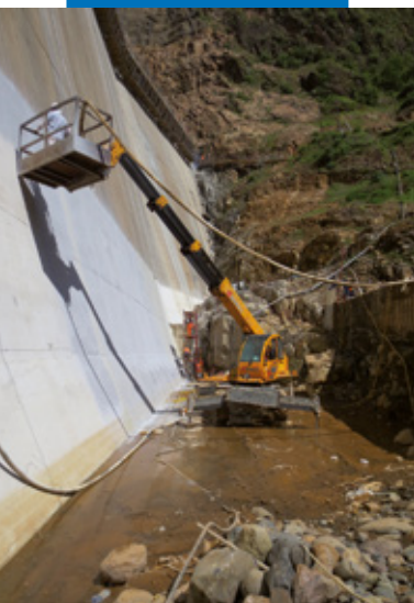
Waterproof coating on a dam

Purtop 1000 must be applied in layers at least 2 mm thick and its very short reaction time means it may also be applied on vertical surfaces.