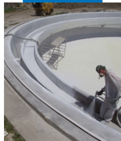
Application of Purtop 1000 onto industrial storage tanks