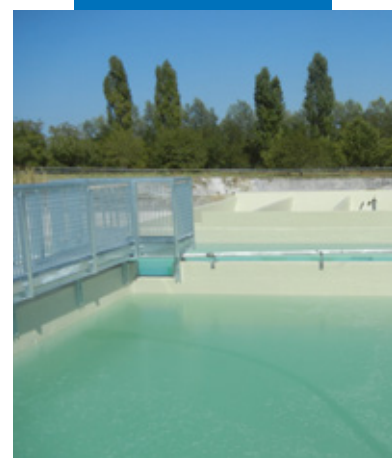
Storage tanks waterproofed with Purtop 1000